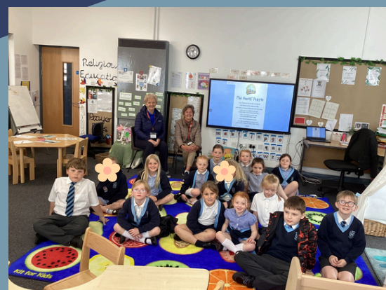
Visit from members of the SVP group at St Mary's Parish